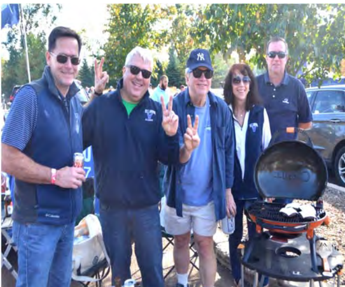
Class of '85 Cooking Burgers on the grill