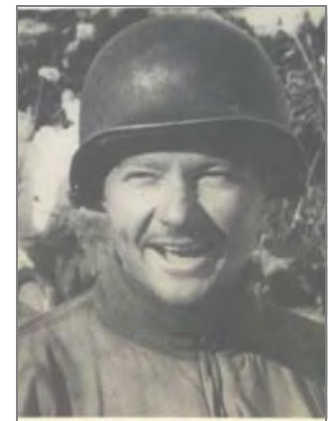
Pat Brady, comic sidekick of Roy Rogers, during WWII