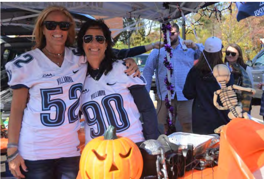
Halloween Football Moms vow to put a spell on the team!