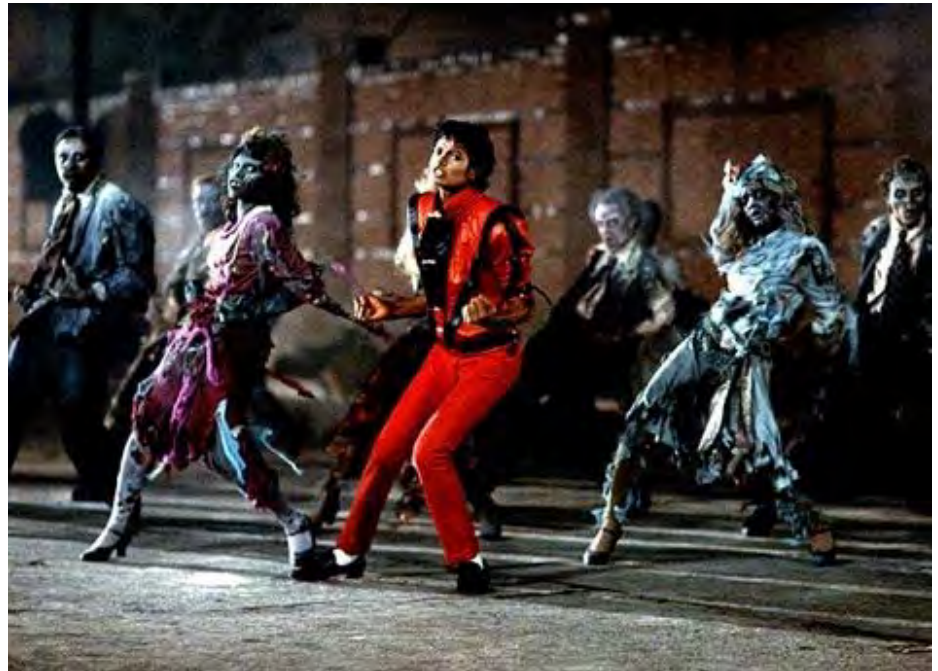
Michael Jackson dancing to his 1982 hit, Thriller

We've been searching for a way to create a replacement income stream that was once provided through the credit card program. We have a brand new bigger and better vehicle that's a no-brainer, but it only works if we get everyone on board! Online shopping is the way of the future, so we found a way to earn 2-20% cash back to Blue White by shopping from your favorite stores. We know grandparents, parents, and children shop online, so why not earn cash back at the same time— what a thrill!