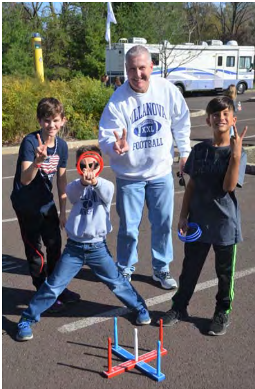
V is for Victory, B is for Blue, W is for White- C'mon support Blue White