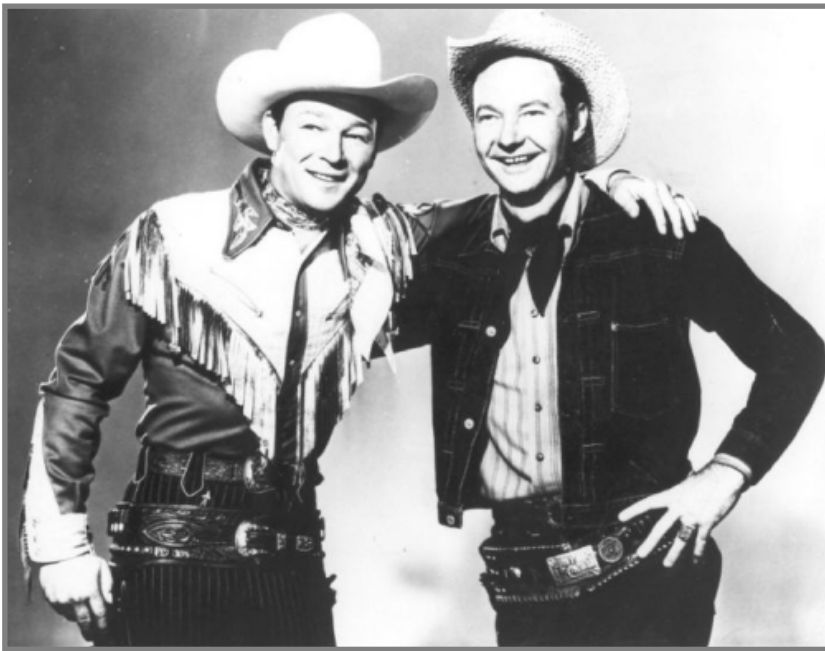
Pat Brady, right, with Roy Rogers