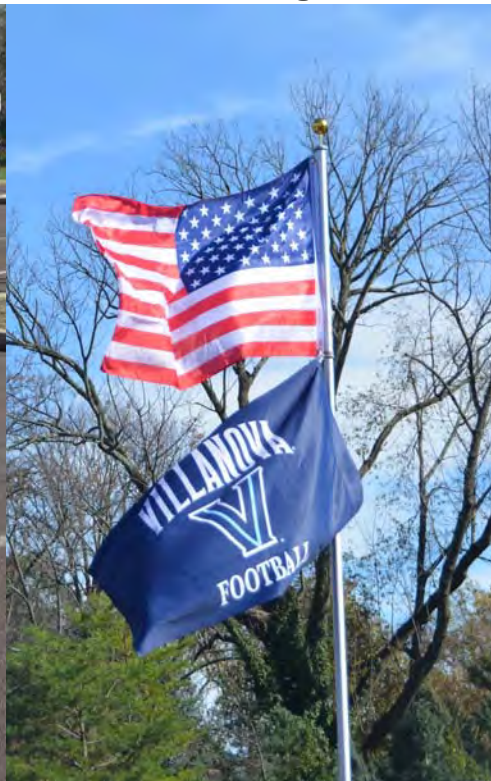
Proud to be an American and Proud to be a Villanova Alumni