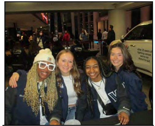
A photo of me, another manager, and two of the players at one of their NIL events at a men's game at Wells Fargo Center

The impact of Title IX extends into the academic realm as well. By mandating equal opportunities for women in education, Title IX has significantly increased female participation in STEM fields, leadership roles, and higher