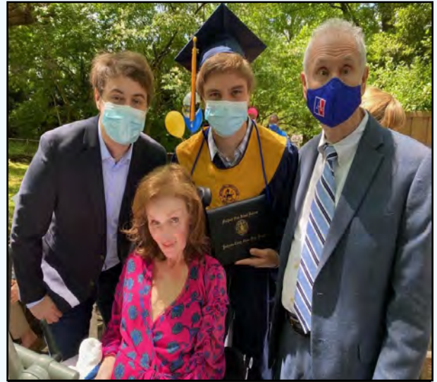
High School Graduation with my brother (left) and my Mom and Dad.

The Blue White Scholarship has played and will continue to play, a pivotal role in shaping my Villanovan journey. Getting to Villanova, and remaining at the school, has been tumultuous. I grew up in a large house with two loving parents and a great community of friends around me. In 2006, my father was diagnosed with Parkinson's Disease. However, he managed the symptoms well and it was never a huge factor in our lives. After the recession, combined with worsening symptoms from my dad in the early 2010's (decreasing his ability to work), and increasing medical care costs, my family's finances grew worrisome. In 2016, when I was a freshman in high school, we moved out of our house, and my brother and I got part-time jobs to help support the family. In July 2018, everything took a turn for the worse. My mom was diagnosed with Amyotrophic Lateral Sclerosis or ALS. Just months later, my life as a student changed completely, and I went from captain of my crew team to a caretaker for my mom.