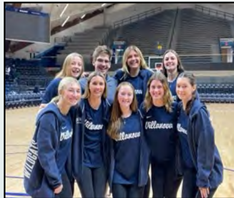
A group shot of all the managers.

Beyond the sports arena, Title IX has been instrumental in fostering a safer and more inclusive campus environment. It provides essential protections against sexual harassment and assault, ensuring that women can pursue their academic and extracurricular activities without fear.