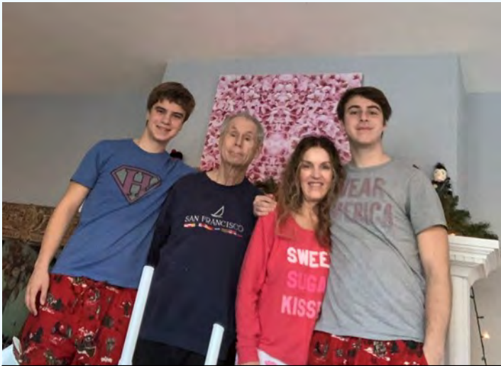
Christmas (2019) with family. I am a junior in High School. Pictured from the left is me, my dad, my mom, and my brother. Each year my parents would buy me and my brother matching pajamas for Christmas.

My life consisted solely of school, crew, and caretaking. I'd wake up at 6:00 AM to help my mom prepare for the day and start homework around 10:00 PM after getting her to bed. It was undoubtedly the hardest time of my life. What carried me through, however, was our community. It was people like you, who so selflessly donated, that allowed us not only to keep her in our home but provide her with a quality of life that so many are not fortunate enough to receive. I am forever grateful to those who helped in our time of need, just as I am grateful to you now for helping me once again in another time of need.