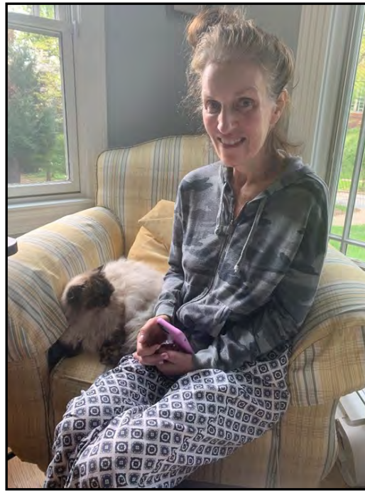
My mom pictured a year into the disease with my cat, Lola.

The notion of making it work continued once I got to Villanova. I worked over 10 hours a week my first semester, took 19.5 credits, and visited home twice a week (2.5-hour drive each way), once during the week (where I'd