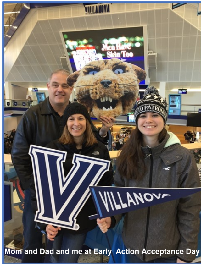
Mom and Dad and me at Early Action Acceptance Day

events such as game watches, on the green activities, holiday events and special events for seniors. I am an officer for Food Recovery, which donates excess cafeteria food to local community food banks, and I am also part of the Mental Health Club.