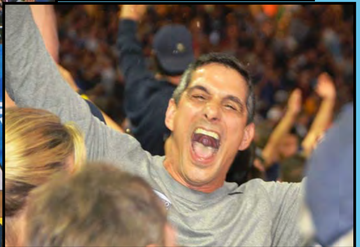
Thirty One Years later –The 1985 NCAA Men's Basketball Team– Cheering the Wildcats!